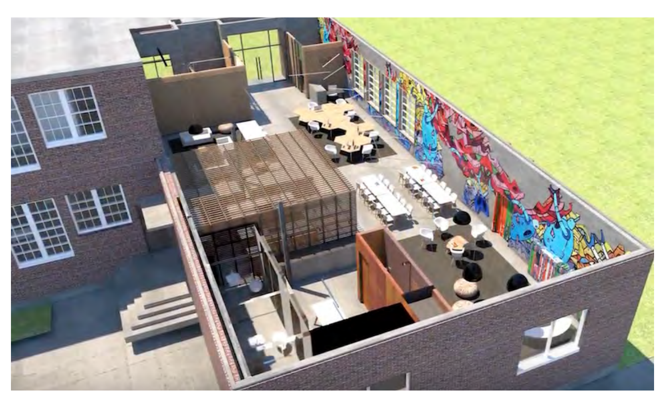
Bird's eye view of the After8 to educate new facility.